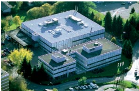
Head Office, Agathon AG Gurzelenstrasse 1, CH-4512 Bellach

IMAGE 5020.2 / Date: 12.08.2013 / Technical information subject to change